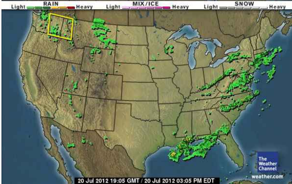
National Doppler Radar