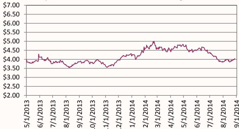
Nymex Natural Gas 12 Month Forward Average

Weather: High pressure keeps much of the region dry through Saturday before a new frontal boundary increases rain chances late this weekend. Highs temperatures today will range from the 70s from eastern Pennsylvania and New Jersey up to New England to the 80s across the rest of the Middle Atlantic region. We'll start to see showers and storms enter western New York and western Pennsylvania Saturday night. Showers and storms return for much of the region on Sunday as the next cold front moves in. Some wet weather lingers near coastal areas on Monday for Labor Day.